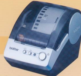
Brother QL-550 Label Printer

Direct thermal label printing directly from your PC. The Brother QL-550 offers all the features of the QL-500, with an automatic cutter. This means you can print labels of virtually any size or design and the QL-550 will automatically provide a label with smooth, straight edges.