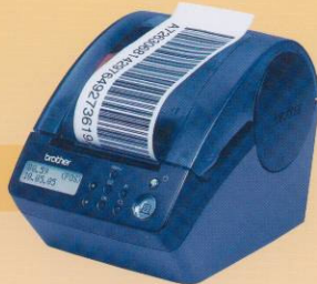
Brother QL-650 TD Label Printer

Unique in the labelling market, the QL-650 TD prints die-cut labels in nine popular sizes as well as continuous-length labels, even when it's not connected to your computer! The fastest, easiest and most versatile way to print labels in seconds.