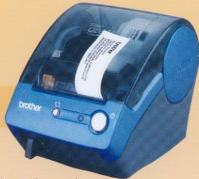
Brother QL-500 Label Printer

The Brother QL-500 direct thermal label printer makes it easy to create customised labels for a wide variety of home and office applications, including files and folders, signage, envelopes and packaging, shelves, storage, CDs, videos and bar codes.