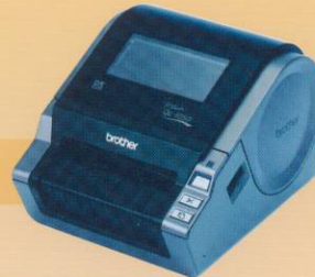
Brother QL-1050 Label Printer

Featuring a wider, high-resolution direct thermal print head that enables you to print high-quality labels up to 102 mm wide at print speeds of up to 110 mm/second, the QL-1050 is the latest addition to Brother's range of Professional Label Printers.